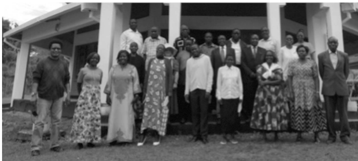
Fig. 3. Africa Quaker archives workshop at FTC November 2022. It featured trainings for oral history interviewers and practical guidance for clerks and recorders from local and yearly meetings.